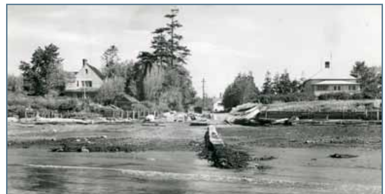
Buxton family (left) and Fleming Beach (above)