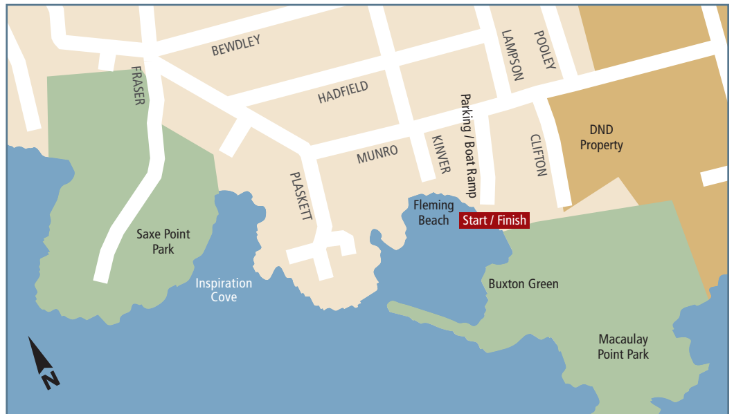
All photos this page: Macaulay Point